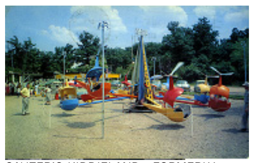
SAUZER'S KIDDIELAND - FORMERLY NEAR CROSSROADS INTERSECTION