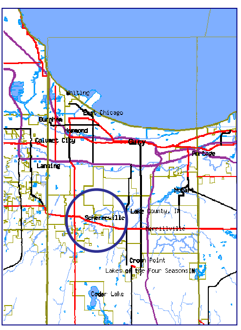
EXHIBIT 2 - REGIONAL MAP

AREA CONTEXT GOVERNANCE STRUCTURE HISTORY SOCIAL AND ECONOMIC PROFILE