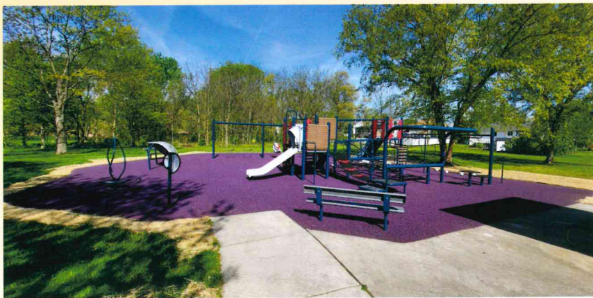
Foxwood South Park now features new playground equipment with poured-in-place rubber surfacing.

Foxwood South Park at 7500 Starling Drive has 3.6 acres of land that include a playground, two tennis courts, a drinking fountain, and small shelter. The tennis courts here are also lined for pickleball using the tennis nets.