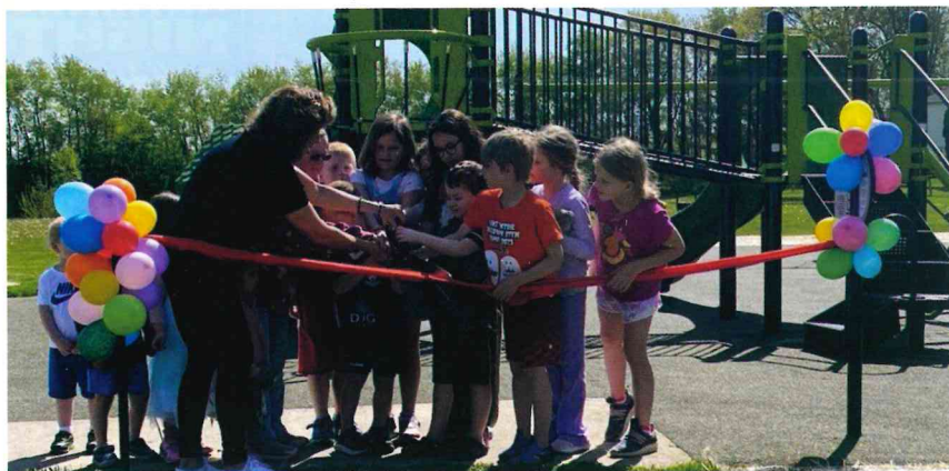
Local residents, including children, helped cut the ribbon to officially open Foxwood North Park.